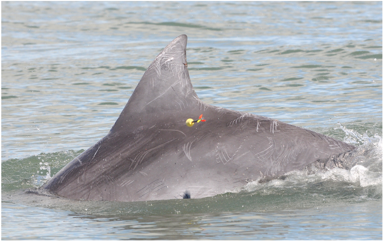
Figure 1. Biopsy sampling of a male coastal bottlenose dolphin ( Tursiops truncatus ) photo-identified by permanent nicks on the trailing edge of the dorsal fin. Biopsy samples obtained from wild dolphins are useful for a series of analyses including genetics, stable isotopes, fatty acids and contaminant loads. 21 December 2011, adjacencies of the Patos Lagoon Estuary, southern Brazil.

advances in techniques such as mark-recapture, telemetry, radio tagging, acoustics, genetics, geographic positioning systems, and stable isotope analyses, has led to a better understanding of the biology and ecology of wild populations (Figure 1).