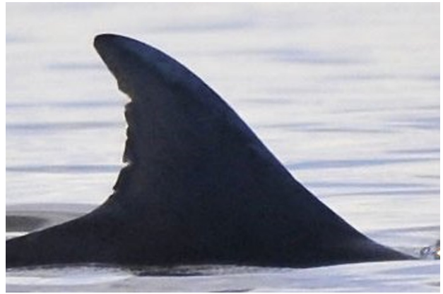
Figure 2. Example of a dorsal fin profile of bottlenose dolphin (designated as M43 in Table 2), photo-identified on various occasions in Bahía San Antonio (left) and the Río Negro Estuary (right).

1m) have a mean annual temperature of 19°C (M. Failla, pers. obs.). Generally, the coast drops off steeply with depths of up to 2m at a distance of only 5m from the coastline. The Río Negro, which terminates in this estuary, is the longest river in Patagonia. The annual mean tidal amplitude is approximately 2.2m (M. Failla, pers. obs.).