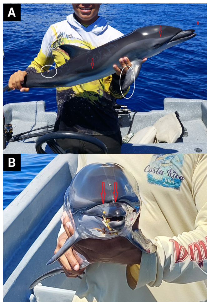
Figure 2. Young Clymene ( Stenella clymene ) dolphin that was found floating dead off Costa Rica on 02 November 2022. Diagnostic species characteristics (red arrows) are included. A) Three-part color pattern and the cape dips above the eye and below the dorsal fin; B) “mustache” marking and dark stripe on the top of the beak running from the tip to the apex of the melon.

The present record adds one species to the current inventory of the cetacean fauna of Costa Rica, increasing the number of confirmed species to ten. Based on the presence of the pantropical