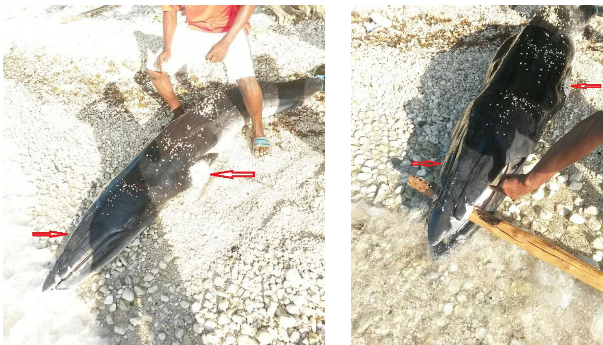
Figure 2. External aspect of the minke whale calf entangled in a single layer gillnet off Côtes des Arcadins, Gulf of Gonave, Haiti, during February 2017, showing diagnostic characters (indicated by red arrows).

While the fisheries sector plays an important role in Haiti's economy, Haitian small-scale fishing remains relatively unproductive compared to other island nations in the Caribbean (David et al., 2021). Artisanal fishing in Haiti is primarily characterized by oar-driven or sail-fitted canoes and wooden skiffs, and only more recently have fiberglass motorboats been