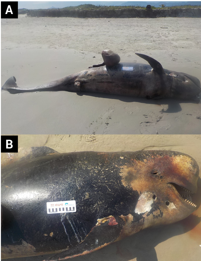
Figure 1. Carcass of short-finned pilot whale, Globicephala macrorhynchus (Gray, 1846) stranded in Peruíbe (São Paulo state, southeastern Brazil), skin detachment and visceral exposure: A) Ventral view of the specimen; B) Lateral view of the specimen.

stranded in Peruíbe (24°28'21.8" S, 47°07'03.9" W, São Paulo state, southeast coast of Brazil). The animal was in poor body condition, with skin detachment and visceral exposure due to scavenger predation, and dental wear in the caudal region of the oral cavity (Fig. 1A and 1B). It was classified as code 4 (advanced decomposition) (Geraci & Lounsbury, 2005), therefore the cause of death could not be elucidated. Its age was estimated at four years by counting the growth-layer-groups (GLG) in teeth, confirming it to be an immature individual (Perrin & Myrick, 1980; Hohn et al., 1989). The digestive tract was preserved, and the stomach content revealed only the presence of a sponge skeleton in the forestomach (Fig. 2A); there were no intestinal contents, but eight specimens of the parasite Bolbosoma sp. were found in the large intestine. The Porifera specimen belonged to the class Demospongiae, and was identified as Aplysina fistularis , measuring 20 cm in length, 7 cm in diameter, with a total mass of 11.79 g measured after dried (Fig. 2B and 2C). The specimen was identified based on its external morphology and overall reticulate architecture of relatively stout spongin fibers, according to Pinheiro et al. (2007) and Hajdu et al. (2011).