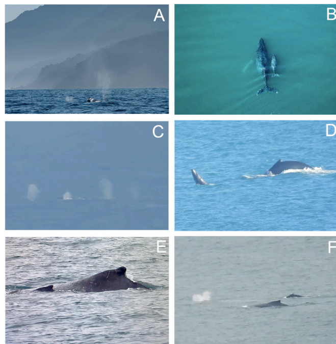
Figure 2. Sightings of humpback whale reproductive behavior observed around Ilhabela Island, Southeast Brazil. (A) Opportunistic sighting of a mother-and-calf pair on 28 July 2018 (photo by Luciano Candisani). (B) A mother-and-calf sighted on 14 July 2019 from land-based station (Photo by VIVA). (C) Competitive group sighted on 11 July 2020 from land-based station (Photo by VIVA). (D) Mother, calf and escort group sighted on 03 August 2020 from land-based station (Photo by VIVA). (E) Mother and calf group sighted on 31 August 2020 at north coast of Ilhabela (photo by Projeto Baleia à Vista). (F) Mother, calf and escort group seen on 02 October 2020 from land-based station (Photo by VIVA).