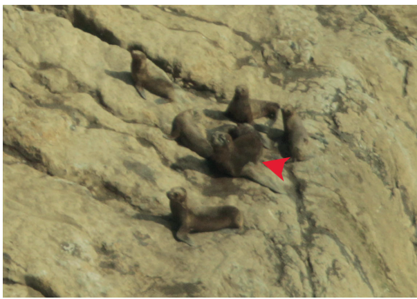
Figure 4. Sighting of an indeterminate sea lion (probably a hybrid specimen between a South American fur seal, Arctocephalus australis , and a South American sea lion, Otaria byronia ), in Punta Chaiguaco haul-out site during the austral summer of 2016. The individual appeared between a group of five juvenile females of South American sea lions. Arrowhead indicates the purportedly hybrid specimen.

southern Peru (Torres, 1985). Later, a synoptic census in the same geographic area during the summer of 1996 registered 20 haul-out sites (comprising 1,598 individuals), with Punta Pichalo (19°31'S) being the only breeding colony (with 38 pups), suggesting that the population was in a process of gradual colonization towards the south 6 . Nowadays, the northern population of SAFS showed an increase in the number of breeding colonies (n= 3) and total number of SAFS (5,378 individuals) in the last census carried out during the summer of 2007. Among these, Punta Pichalo (19°31'S) and Punta Campamento (23°04'S) stand out as the largest breeding grounds of SAFS in northern Chile (76 and 210 pups registered, respectively) 2,7 .