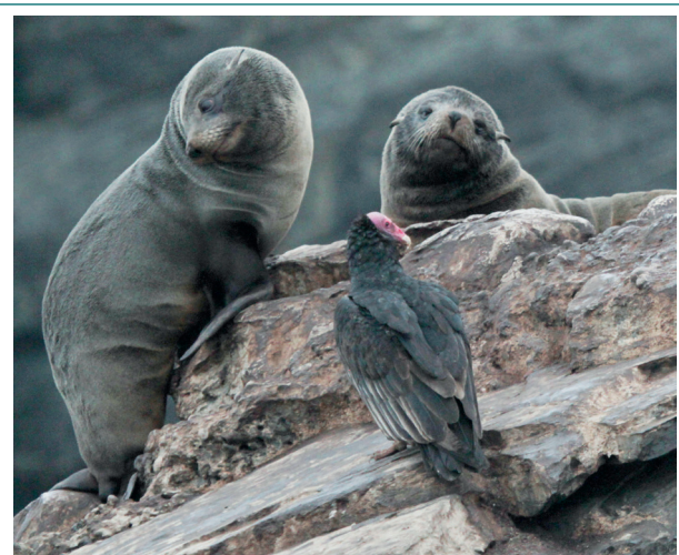
Figure 1. South American fur seal ( Arctocephalus australis ).

Two evolutionary units have been evidenced in the SAFS, through analysis of the size and shape of the skull (morphometric and traditional geometric) (Oliveira et al. ,