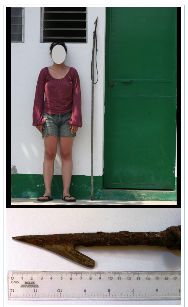
Figure 2. Top: Metal harpoon use to kill dolphins for shark bait along the Pacific Coast of Guatemala. The person standing in the photograph is 162cm tall. Bottom: The head of the harpoon is approximately 18cm long.

1988), Colombia (Ávila et al., 2008), Costa Rica (Palacios and Gerrodette, 1996), Dominican Republic (Vidal et al., 1994), Ecuador (Palacios and Gerrodette, 1996), Honduras (Vidal et al., 1994), Mexico (Vidal et al., 1994; Palacios and Gerrodette, 1996), Panama (Vidal et al., 1994; Palacios and Gerrodette, 1996), Peru (Read et al., 1988; Félix and Samaniego, 1994; Mangel et al., 2009), Uruguay (Franco-Trecu et al., 2009) and Venezuela (Trujillo et al., 2010). The use of dolphin meat as bait seems to be less common as the reports come from fewer countries. However, direct killing has been identified as a serious threat for some dolphin populations (Trujillo et al., 2010). Similarly to Guatemala, dolphin meat is used as shark bait in some countries but it is also used as bait for either Mota fish (Calophysus macropterus), crabs, or scavenger catfishes in others: Brazil (shark bait, Canella and Ximenez, 1990; Mota fish bait, Loch et al., 2009), Chile (crab bait, Goodall et al., 1988; Perrin, 1985), Colombia (shark bait, Avila et al., 2008), Panama (shark bait,