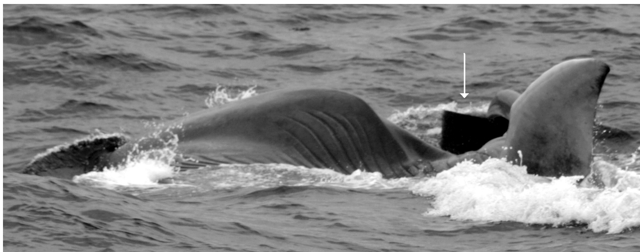
Figure 3. Behavior shown by the whale at the surface in waters off Santa Elena Peninsula, Ecuador. Note the open mouth and the left row of baleen plates (arrow) to the left of the pectoral fin.