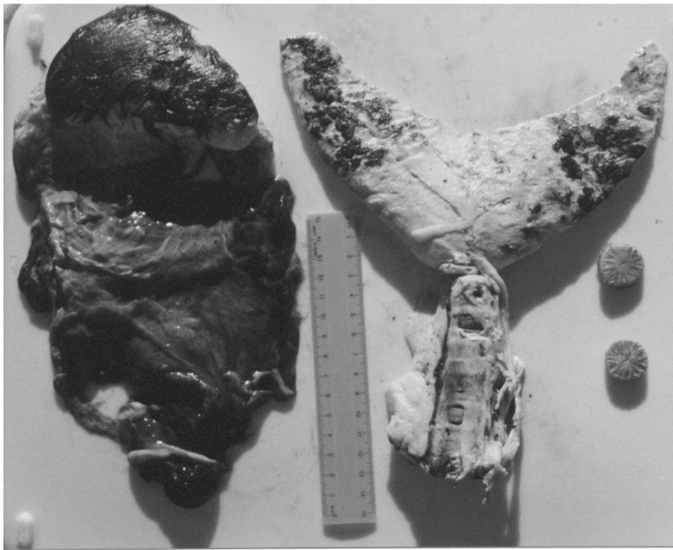
Figure 1. Rest of pinniped and cetacean found in stomach of de Notorhynchus cepedianus captured in San Jorge Gulf, Chubut, Argentina. The reference is a 15cm rule.

Besides this paper and Falabella et al. (1996), there is only one previous record of broadnose sevengill shark predation on marine mammals in the southwestern Atlantic. Praderi (1985) reported for the Uruguayan coast that 17% of the stomach contents of N. cepedianus contained franciscanas and that 1% contained South American sea lions, pointing out that this shark usually predate on marine mammals. In the present study, 15% of the sampled stomachs contained cetaceans, while 25% contained pinnipeds. The overall frequency of occurrence of marine mammals in the stomachs was 35%. This confirms Praderi's (1985) statement that marine mammals are a frequent item in the diet of N. cepedianus . Similarly, Ebert (2002) observed that marine mammals composed almost one third of the diet of N. cepedianus in cephedianus in California, USA, and in Southern Africa.